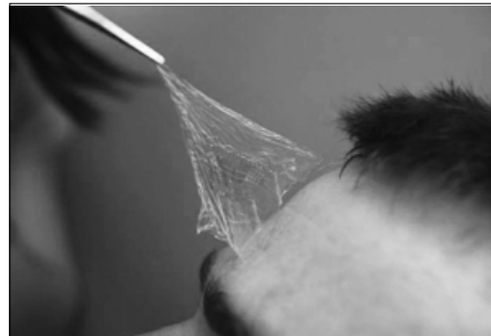
The patch of electronic skin consists of an array of electrical devices for monitoring the vital signs of the body.

research team. A simple stick-on circuit can monitor a person's heart rate and muscle movements as well as conventional medical monitors, but with the benefit of being weightless and almost completely undetectable. Scientists said it may also be possible to build a circuit for detecting throat movements around the larynx in order to transmit the information wirelessly as a way of recording a person's speech, even if he/she were not